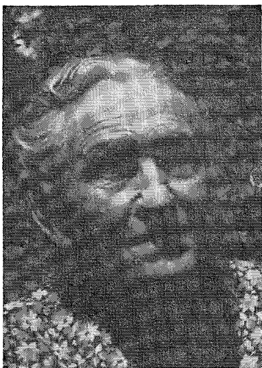
The author in 1950