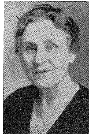
The Author in 1930