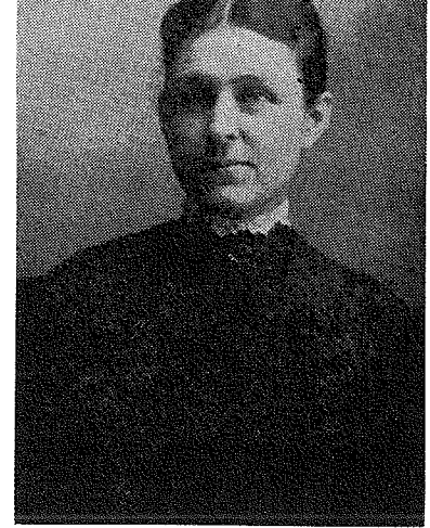
The author as she appeared in 1905